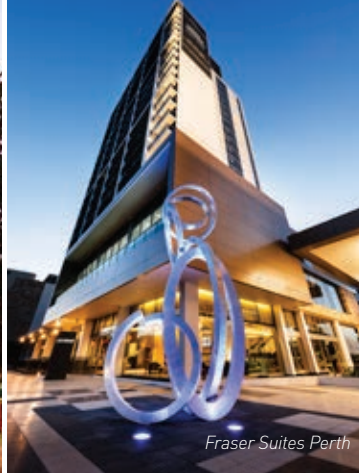
Fraser Suites Perth